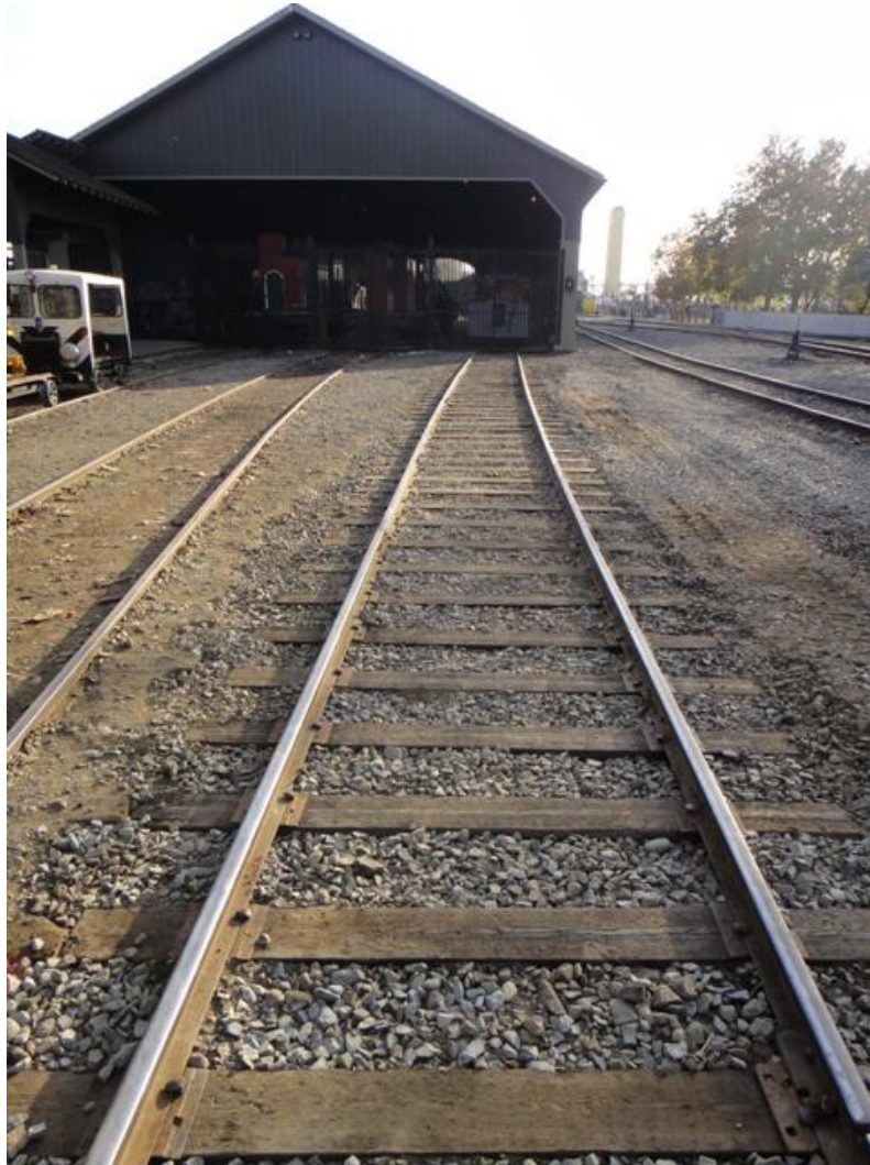
The finished track. Like a carpet of dreams!