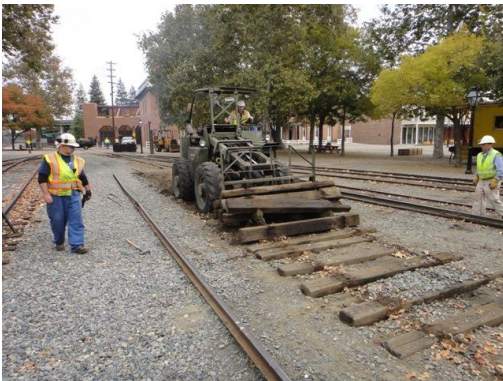
Mike F. and Mike T. guide the Green Machine as we pull out the old ties.

Hello MOW folks and welcome to the late version of the MOW Weekly Update. We had a very busy week last week so let's get down to the updating!