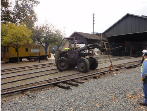
The Green Machine pulls the rail. While Frank looks on. The rail dates back to 1887.